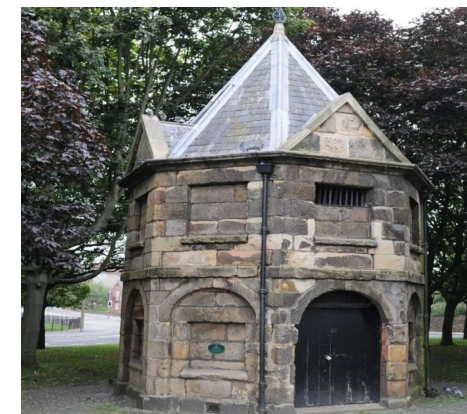
Wavertree Lock Up